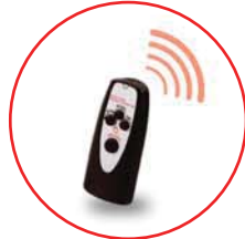
An accessory device