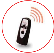
An accessory device