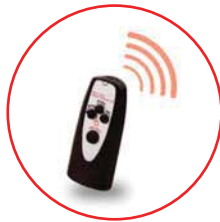
An accessory device